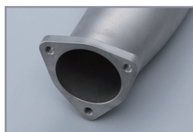
Step-less connection with a 76.3mm front pipe.